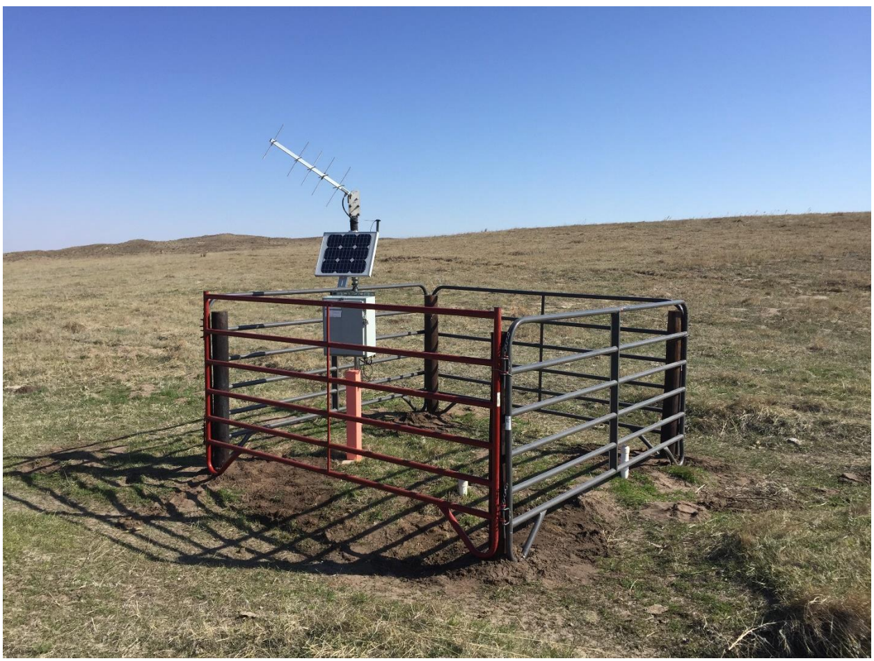
Figure 1-Example of cattle enclosure construction.

Work Performed under Objective 4 included replacing cattle enclosures to protect well sites and electronics. New cattle enclosures consist of four 4 ½" by 6' or 8' treated corner fence posts, buried to a minimum depth of 38". To the corner posts, four 10' by 4' steel corral panels were permanently attached. An example enclosure is pictured in Figure 1. No data was collected during the construction of the cattle enclosures.