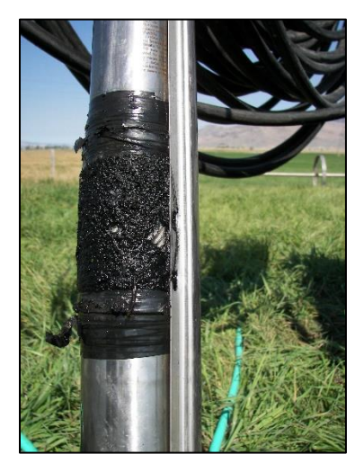
Figure 2. Clogged well screen.

On August 4, 2017, Lewis Drilling mobilized to the site to redevelop the well. Initially water was purged with a 3-inch submersible pump, however pumping was immediately halted because the well intake became clogged (fig. 2). A bailer was then use to purge debris from the well (fig. 3). The well was bailed for approximately two hours until the water was clear. The initial static water level was 34.45 feet, the water level after bailing was 34.55 feet. Sounding confirmed a total depth of 306 feet.