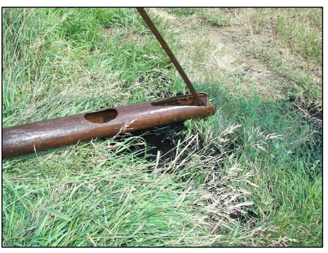
Figure 3. Bailer

Ownership of site MBMG-74121 (site 2, fig. 1) changed since the original proposal was written and the new landowner will no longer grant access to the site. Therefore the proposed work could not be completed and this well has been dropped from the NGWMN network.